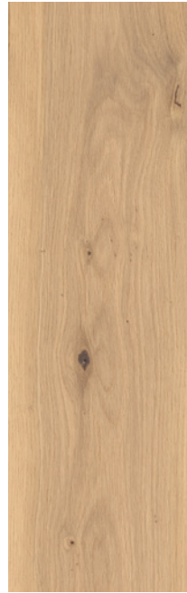
WDRO 804 Tinted