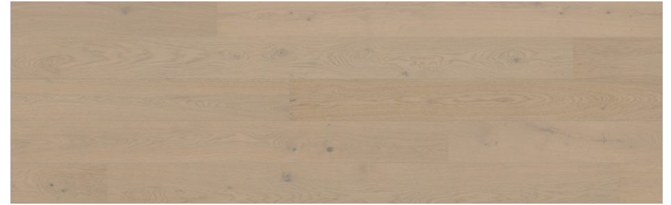
WDRO 802 Matt UV Lacquer