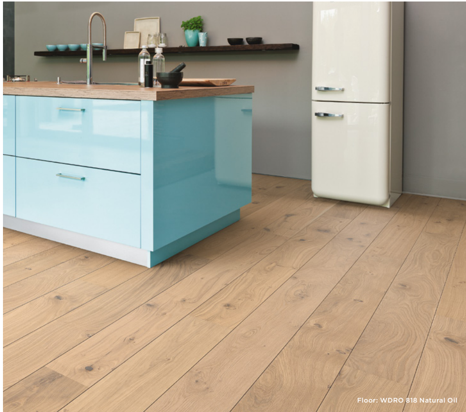
Floor: WDRO 818 Natural Oil