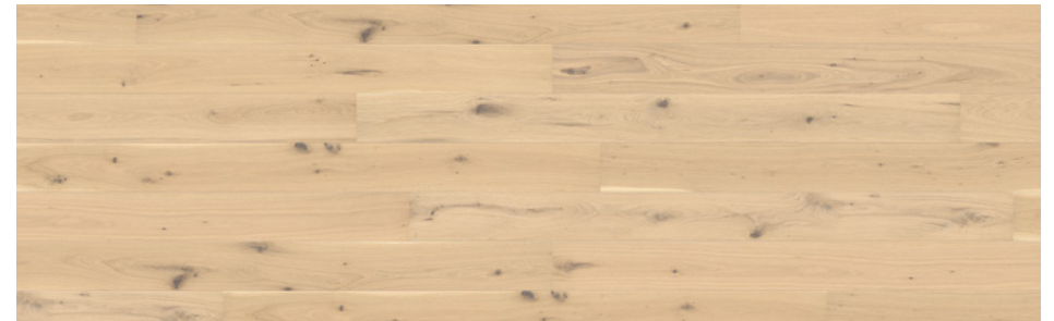
WDRO 801 Matt UV Lacquer