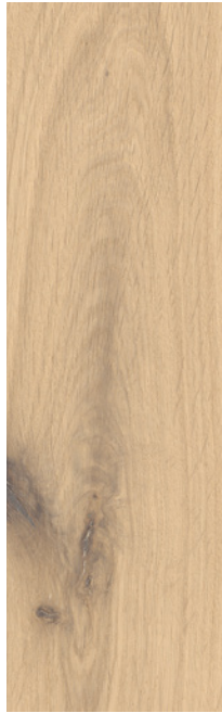
WDRO 801 Tinted