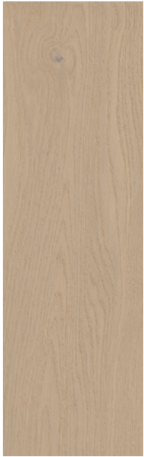
WDRO 802 Tinted