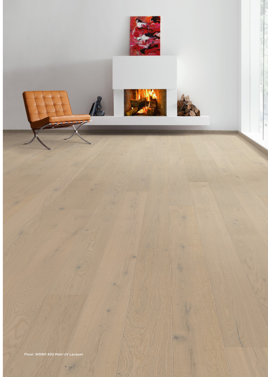
Floor: WDRO 802 Matt UV Lacquer

Robur Fundamental 180 is a range of PEFC-certified, 12mm-thick, engineered European oak in a 180mm-wide plank format. It is forested and produced to exacting and responsible standards. Refer to Robur 180 and Robur 240 for alternative plank formats and Robur Parquet for strip/herringbone formats.