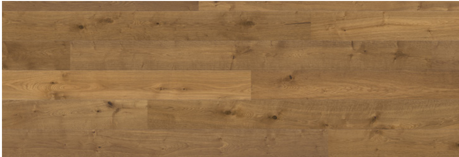
WDRO 816 Natural Oil