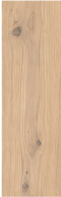
WDRO 818 Tinted