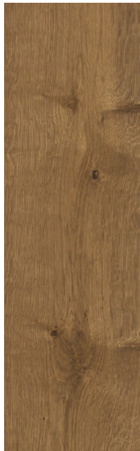
WDRO 816 Fumed