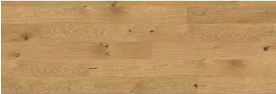
WDRO 805 Matt UV Lacquer