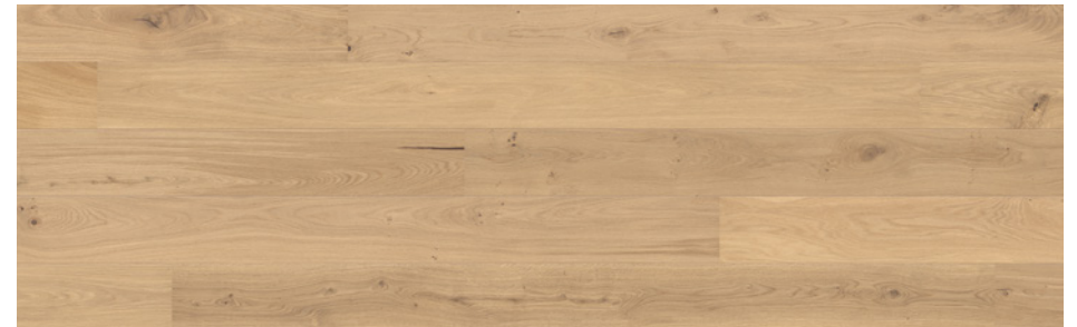
WDRO 804 Matt UV Lacquer