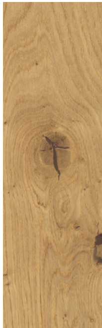
WDRO 805 Natural