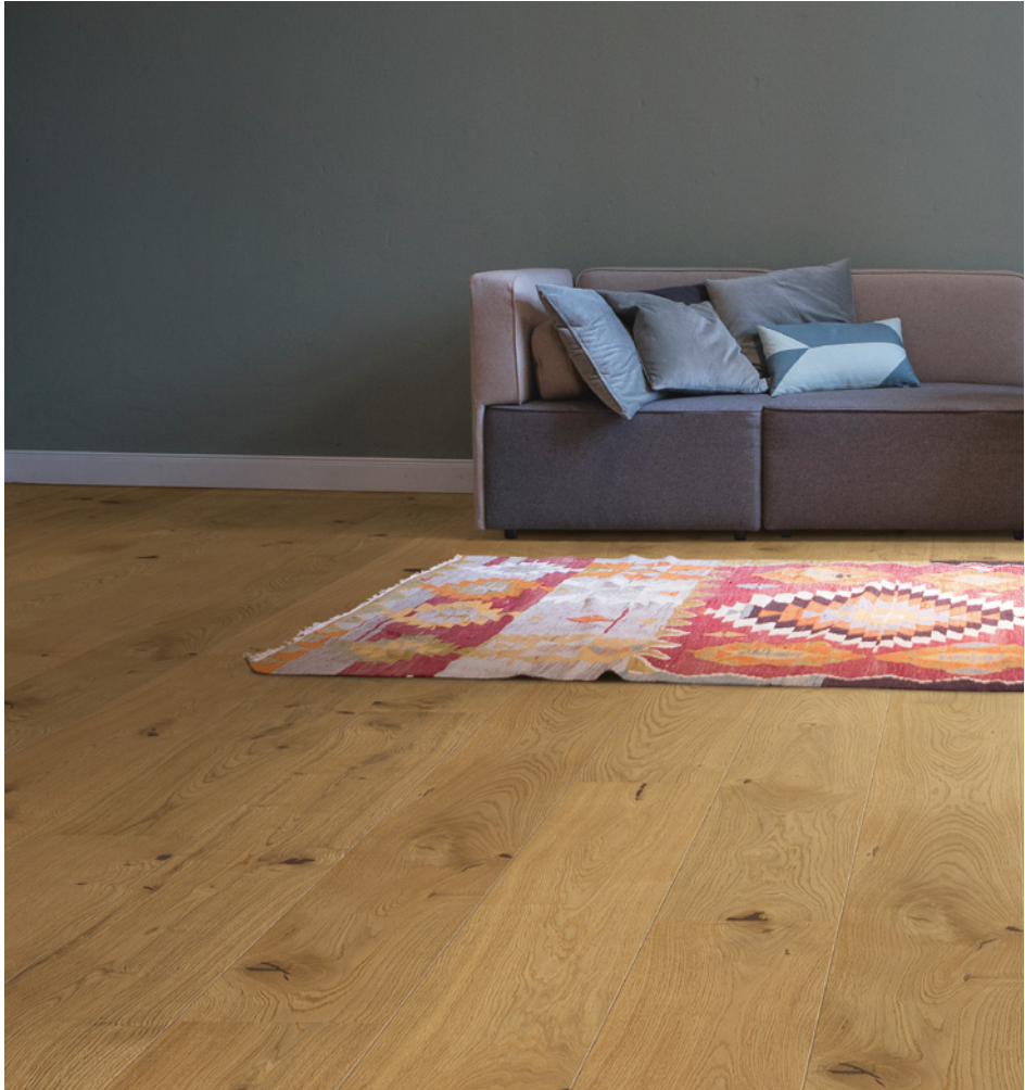
Floor: WDRO 805 Matt UV Lacquer

Cleaning & Maintenance Specification: ETC&M 03 (WDRO 816, 818 & 820) ETC&M 01 (all other colours)