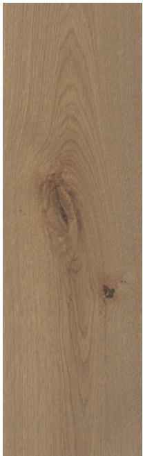
WDRO 820 Tinted