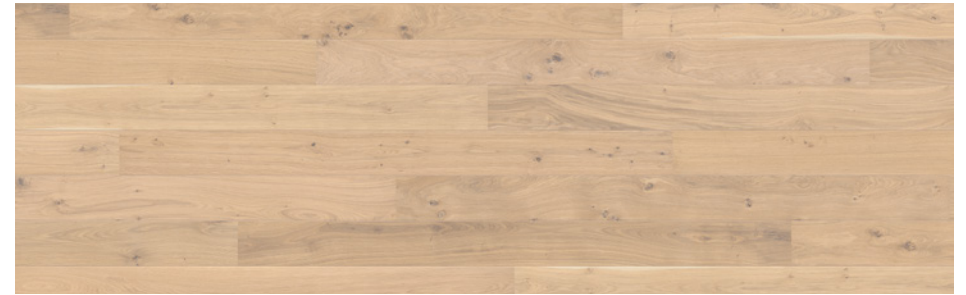
WDRO 818 Natural Oil