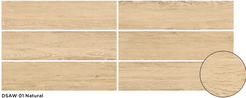
DSAW 01 Natural