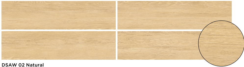
DSAW 02 Natural