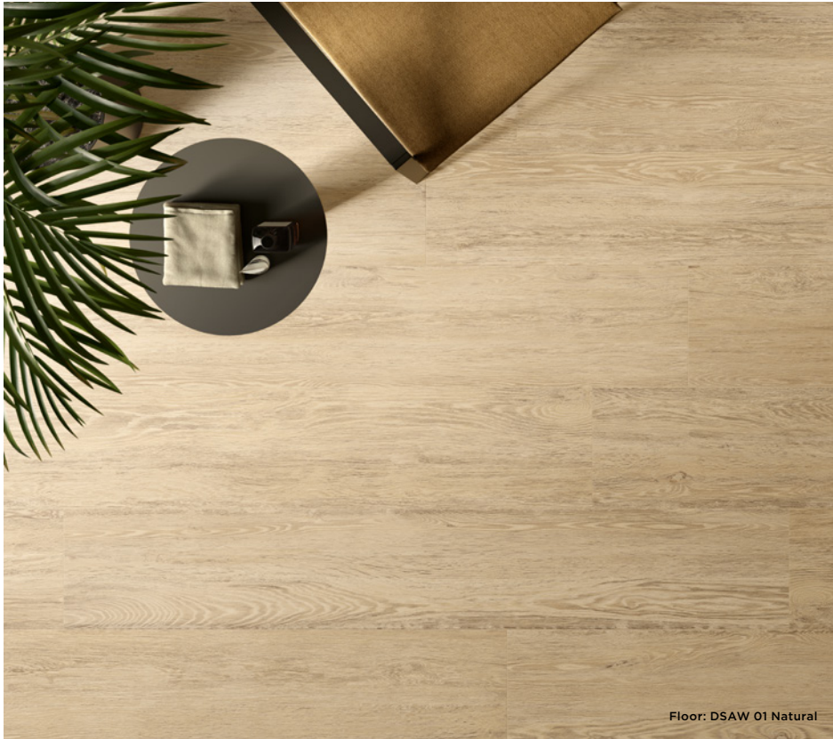
Floor: DSAW 01 Natural