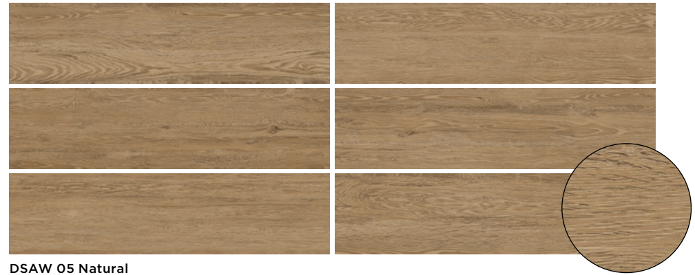
DSAW 05 Natural