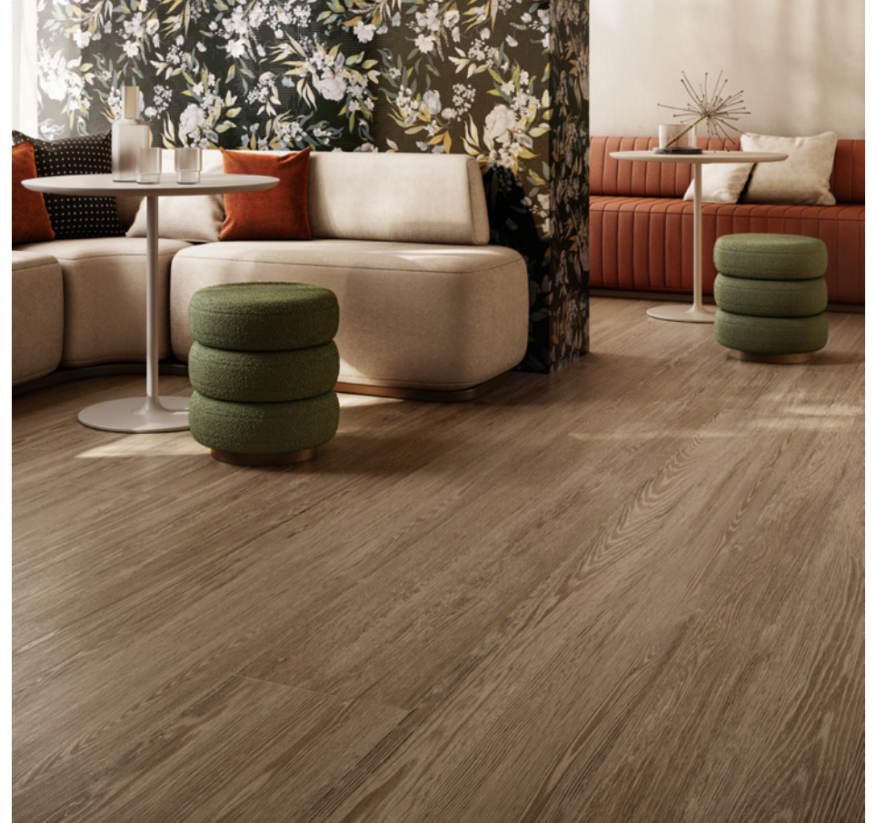
Floor: DSAW 06 Natural