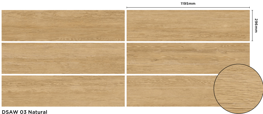
DSAW 03 Natural