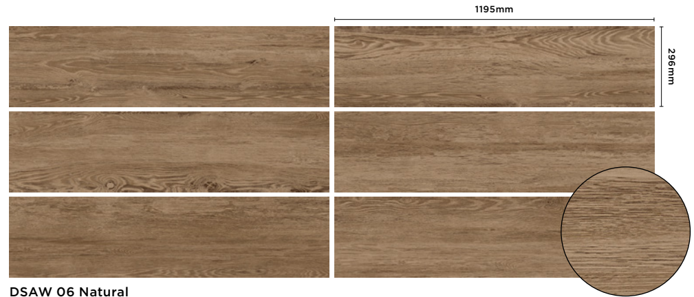
DSAW 06 Natural