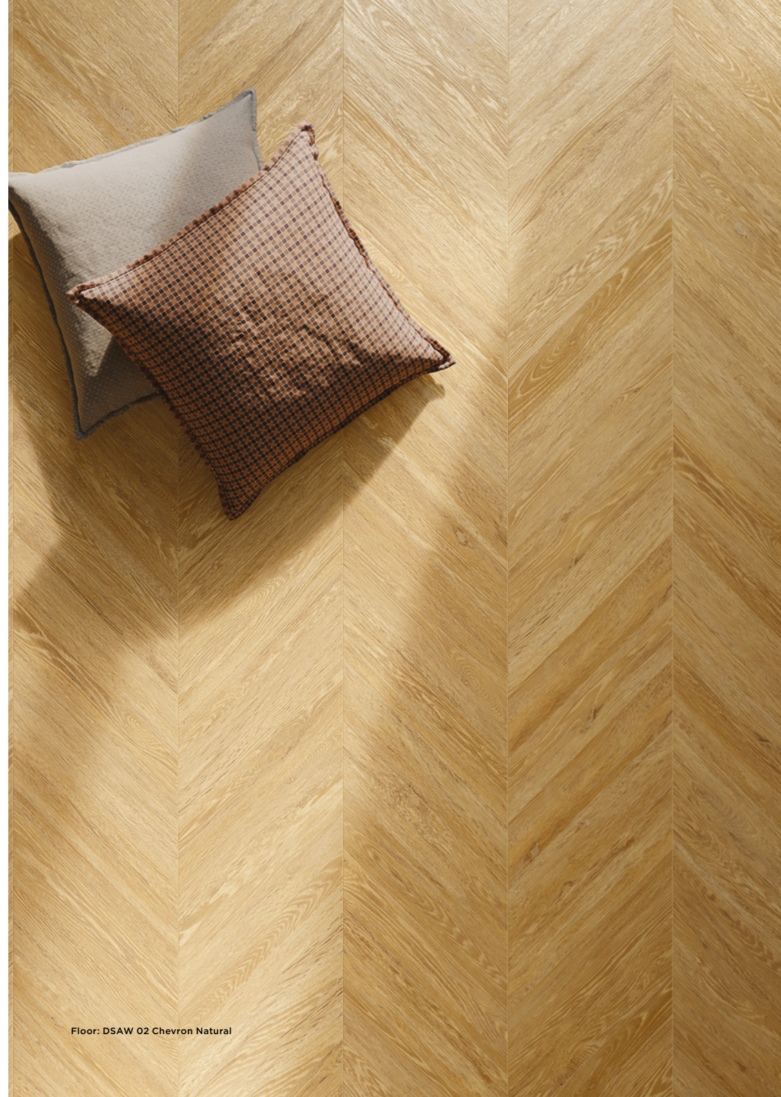
Floor: DSAW 02 Chevron Natural

Sunwood is a wood-effect porcelain tile range that mimics the warmth of its natural counterpart to help create welcoming indoor spaces. Produced with care and respect for the environment, Sunwood welcomes timeless design elements with the inclusion of the chevron format.