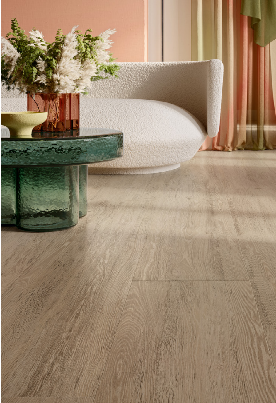
Floor: DSAW 04 Natural