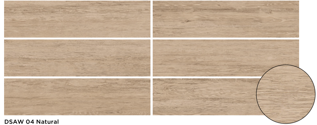
DSAW 04 Natural