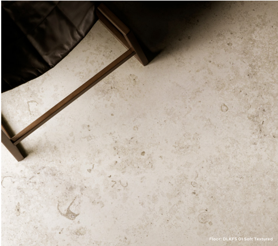
Floor: DLKFS 01 Soft Textured