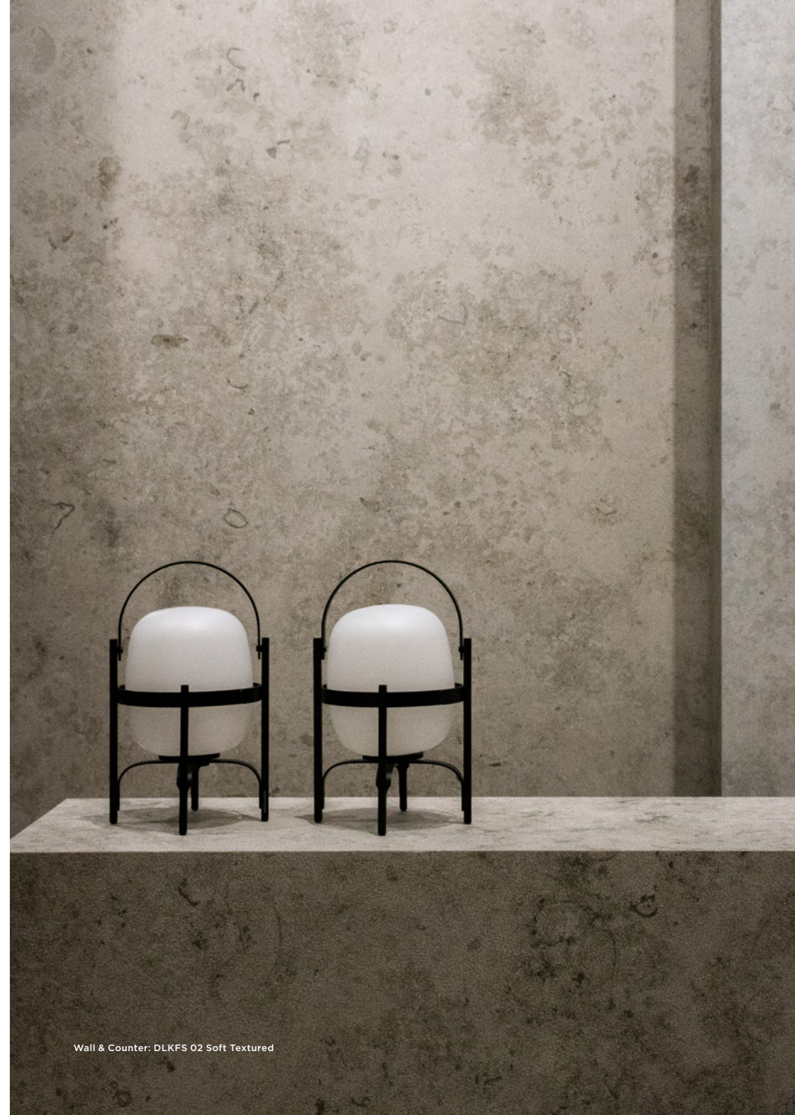
Wall & Counter: DLKFS 02 Soft Textured

Kendo Slim is inspired by the protected stone of the Deutch Jura Mountains, a stone from marine deposits with numerous markings on its surface. This lightweight porcelain slab range depicts dark-coloured organic-shaped markings with an extraordinary richness of intensities.