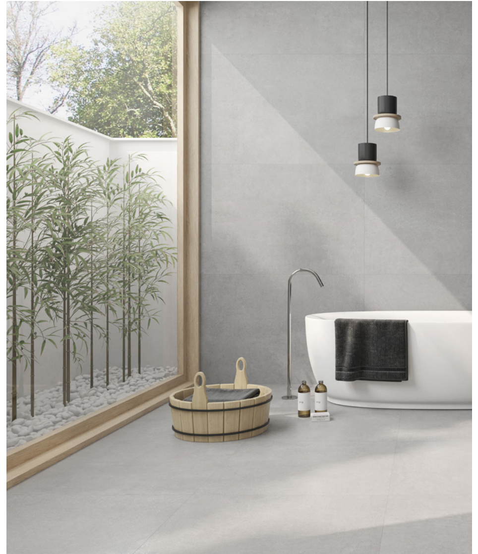
Wall & Floor: DAGF 04 Matt