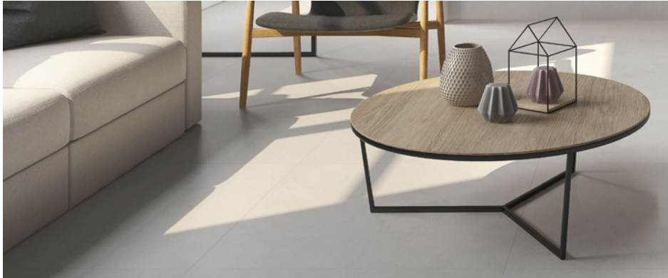
Floor: DAGF 01 Matt