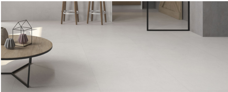
Floor: DAGF 01 Matt

Size (mm) Thickness Finish Colour Availability