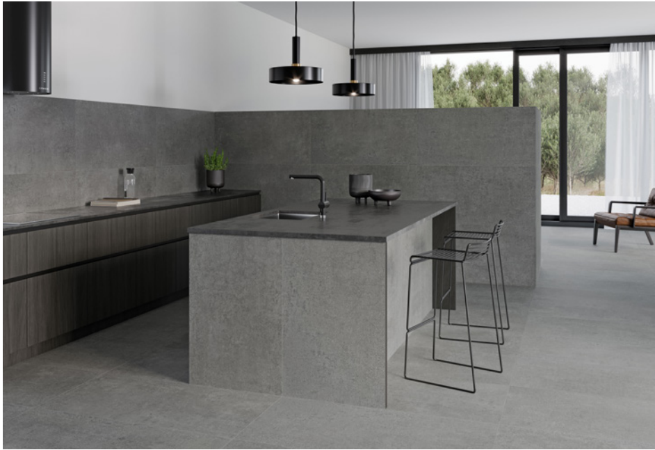
Splashback & Partition Wall: DAGF 05 Matt Counter Sides & Floor: DAGF 04 Matt