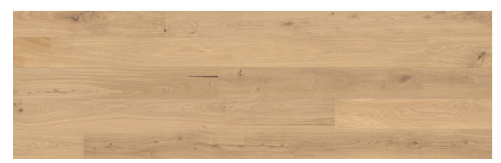
WDRO 804 Matt UV Lacquer