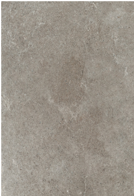
DXF DFSN 03