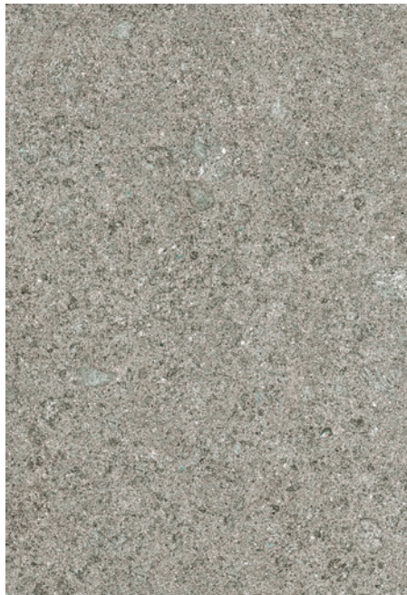
DXF DFSN 04