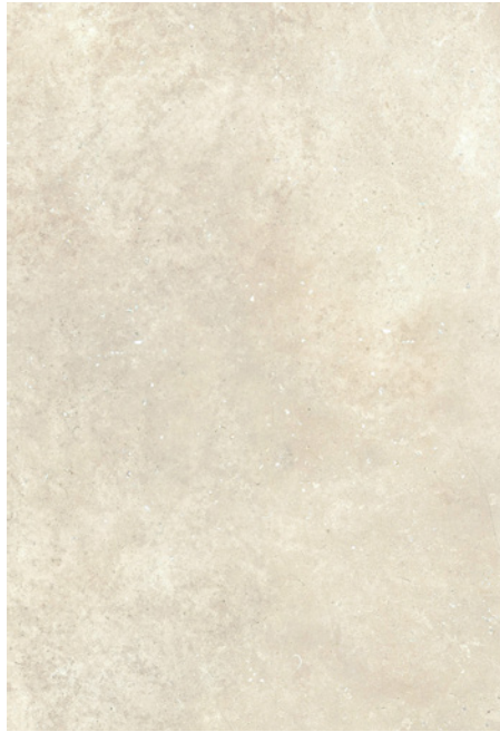
DXF DFSN 02