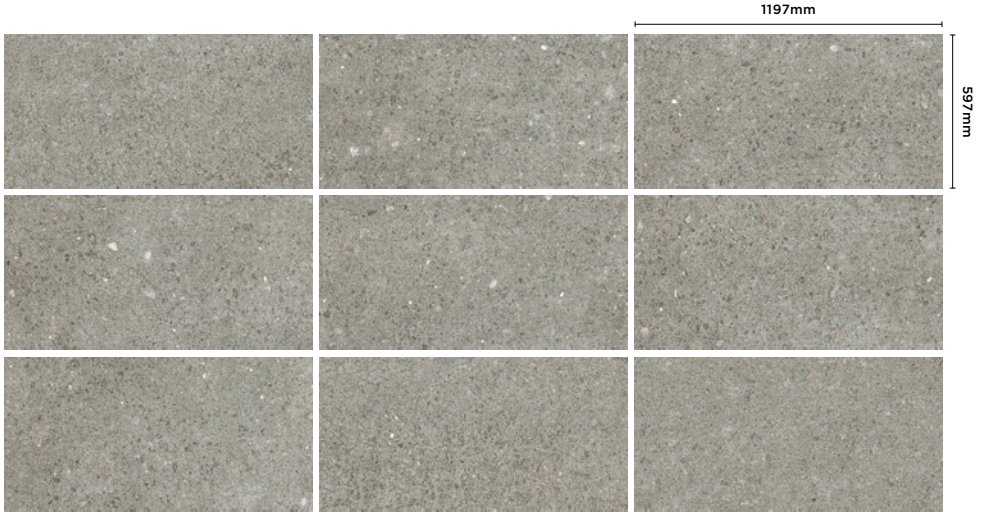
DXF DFSN 04