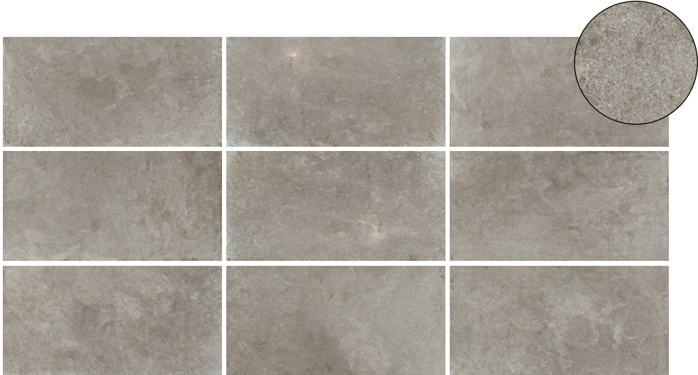
DXF DFSN 03