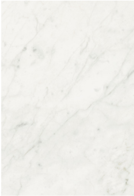
DXF DFSN 01