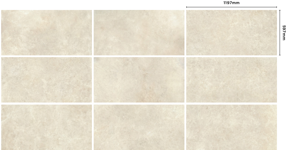
DXF DFSN 02