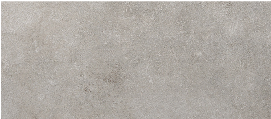
DXF SLE 03