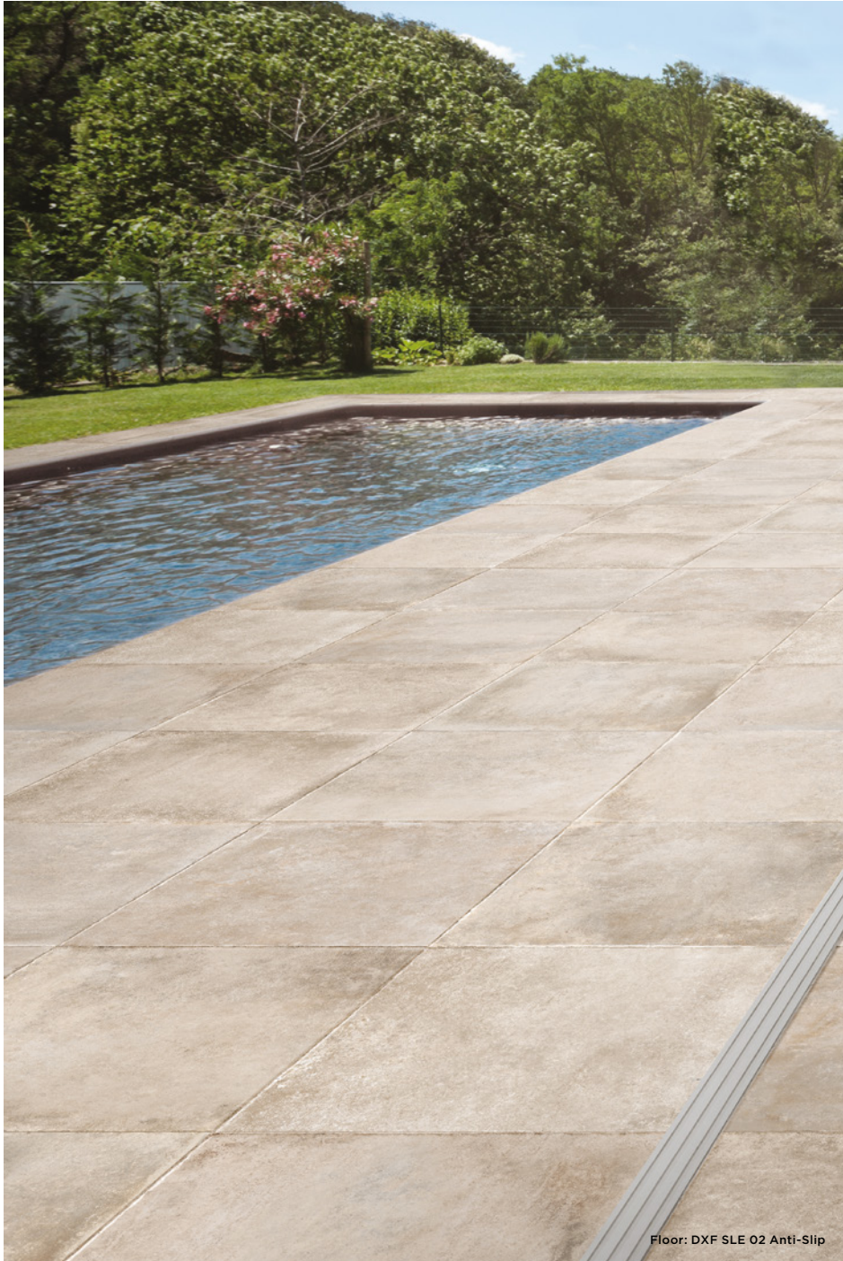
Floor: DXF SLE 02 Anti-Slip