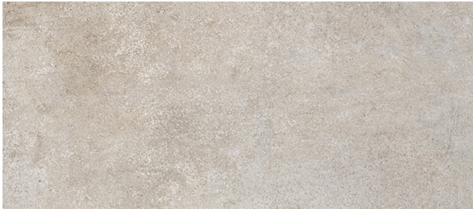
DXF SLE 02