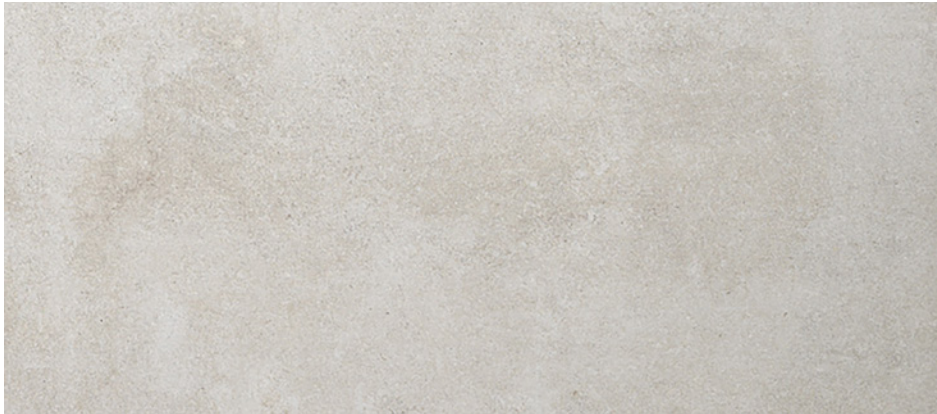
DXF SLE 01