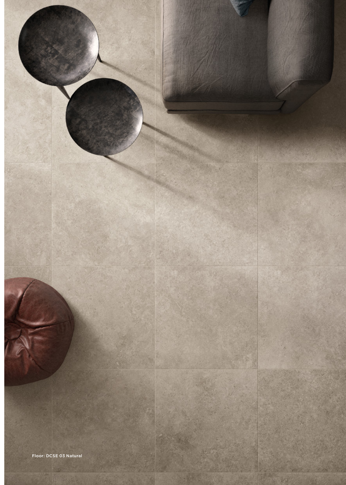
Floor: DCSE 03 Natural

The high technology production process and refined surface finishes make the Secret Stone range of 14mm-thick porcelain stoneware unprecedented in terms of realism. Refer to Secret Stone 20mm for outdoor tiles for use with External Support Systems.