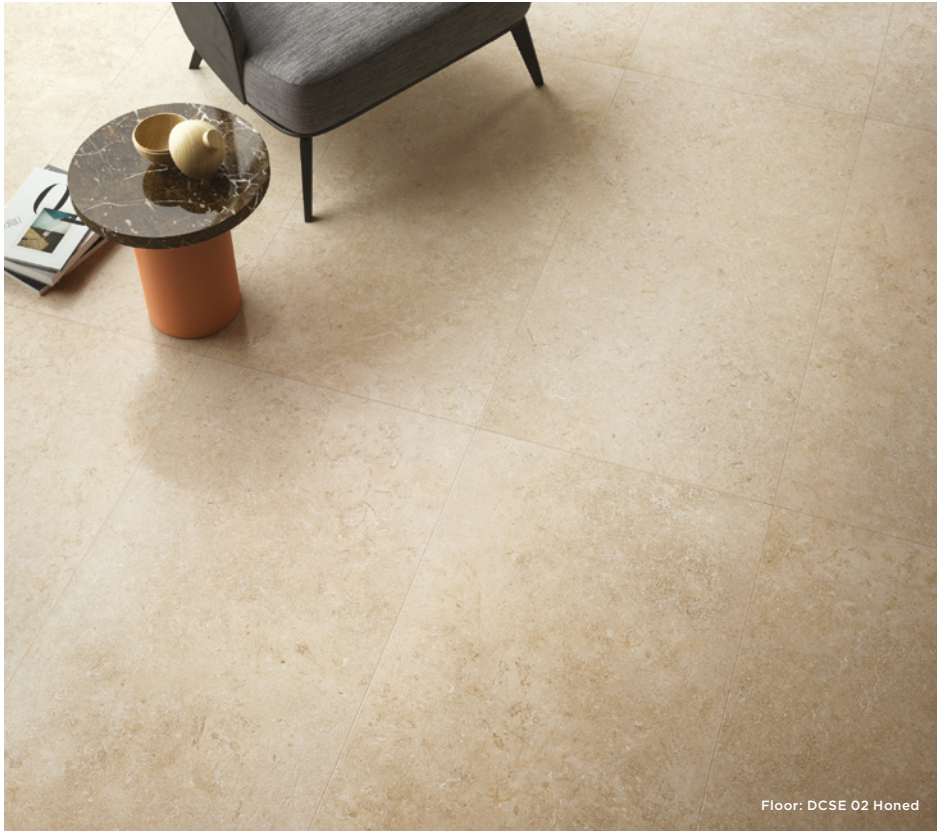
Floor: DCSE 02 Honed