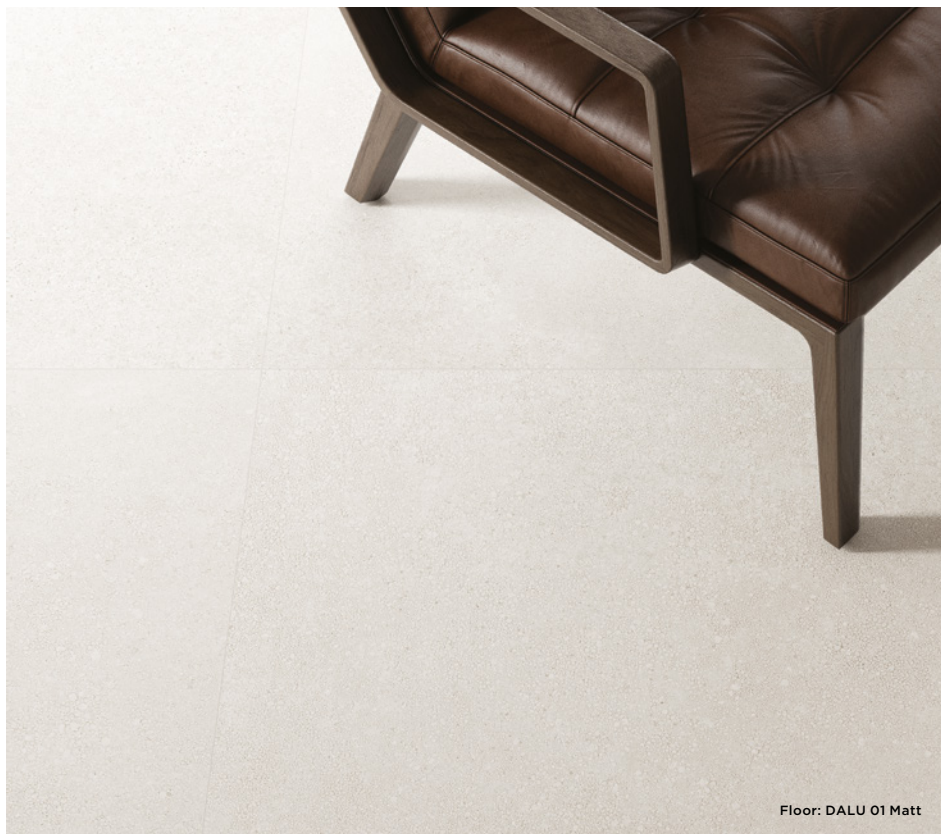
Floor: DALU 01 Matt