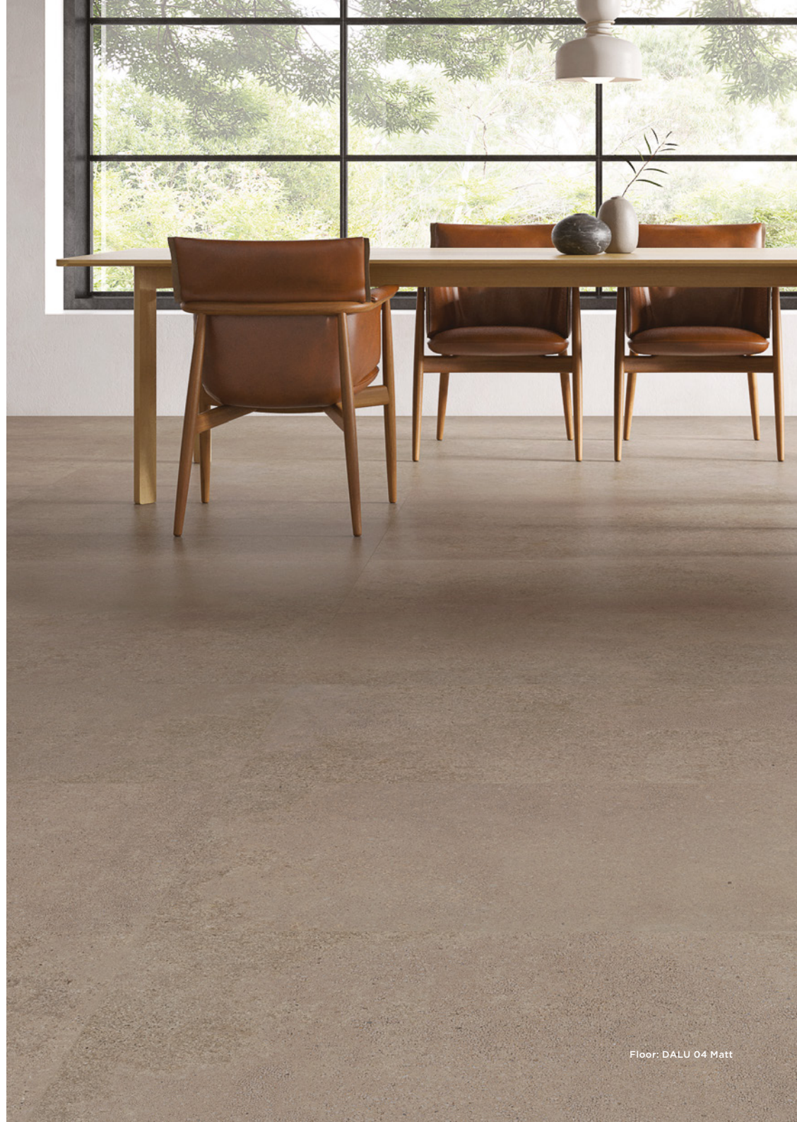
Floor: DALU 04 Matt

Lausanne is a natural and trendsetting porcelain tile range inspired by the crushing and pressing of natural soil used in the sustainable construction of artificial shelters, one of the first materials used by humankind.