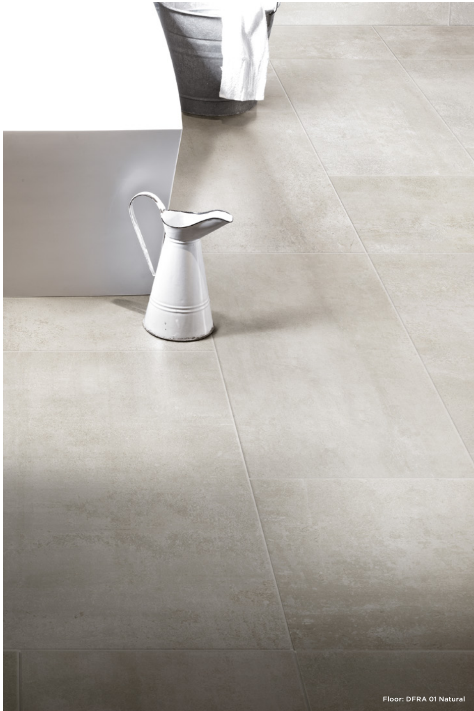
Floor: DFRA 01 Natural