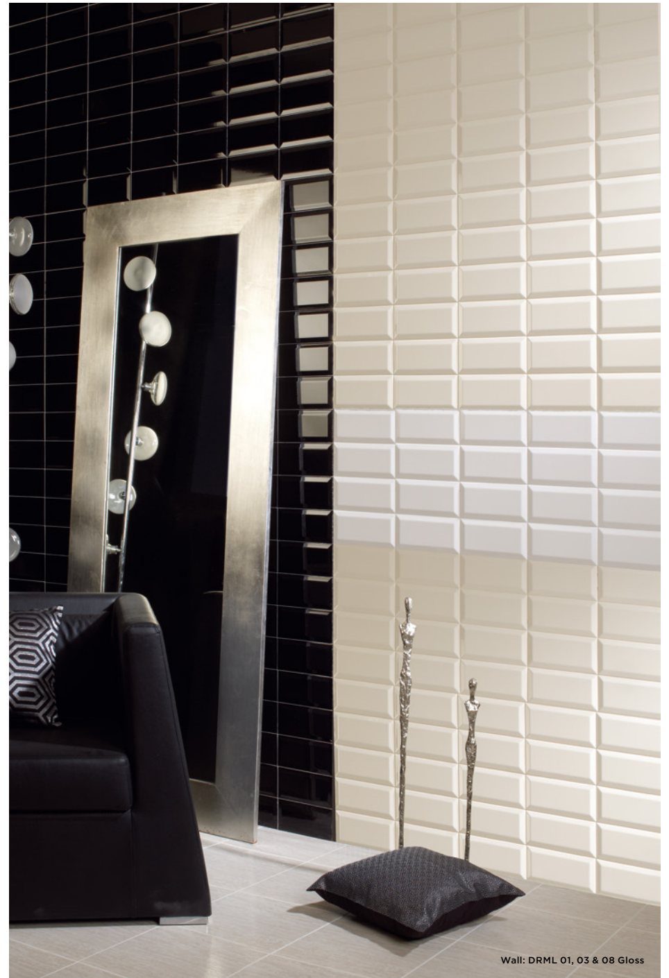
Wall: DRML 01, 03 & 08 Gloss