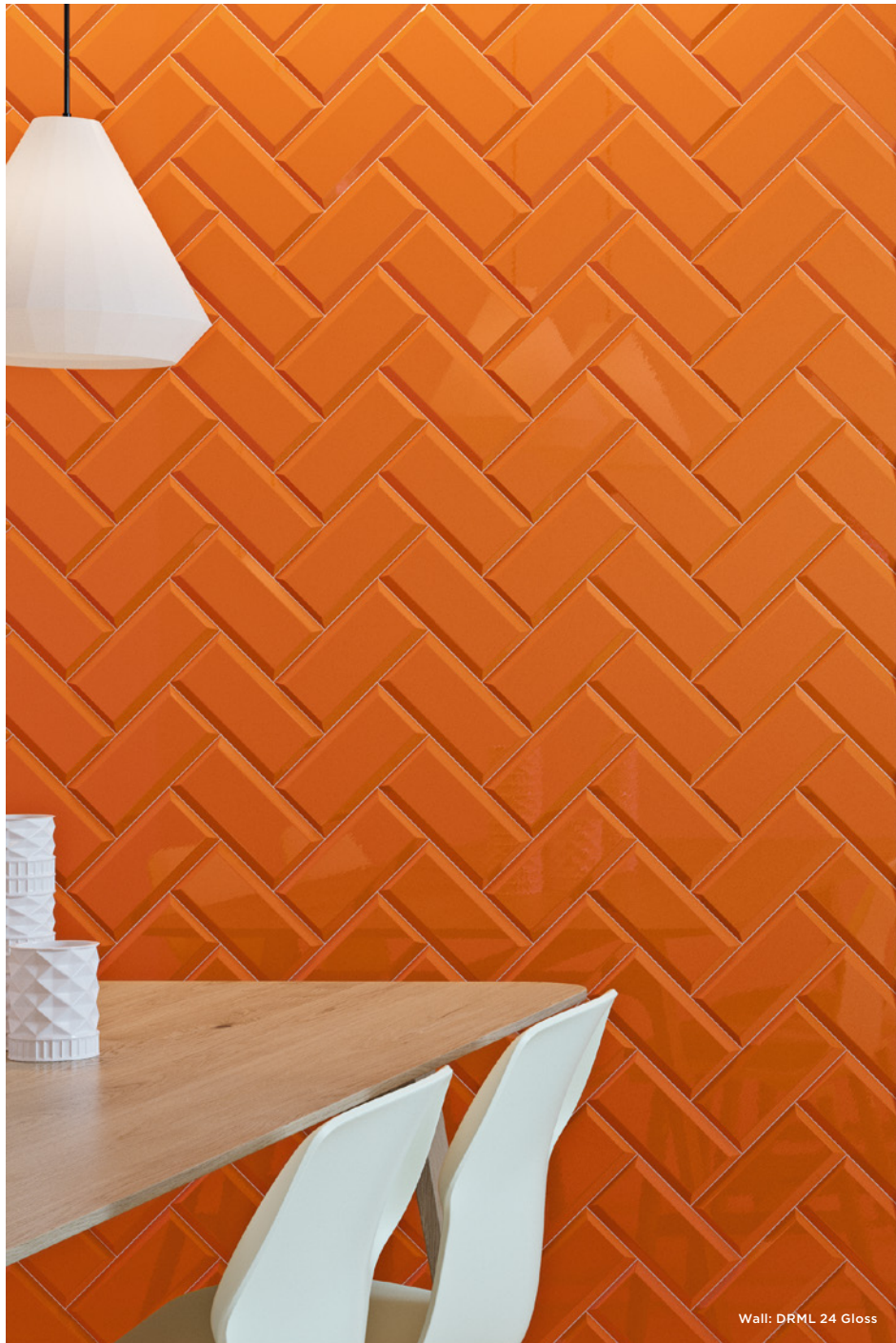
Wall: DRML 24 Gloss