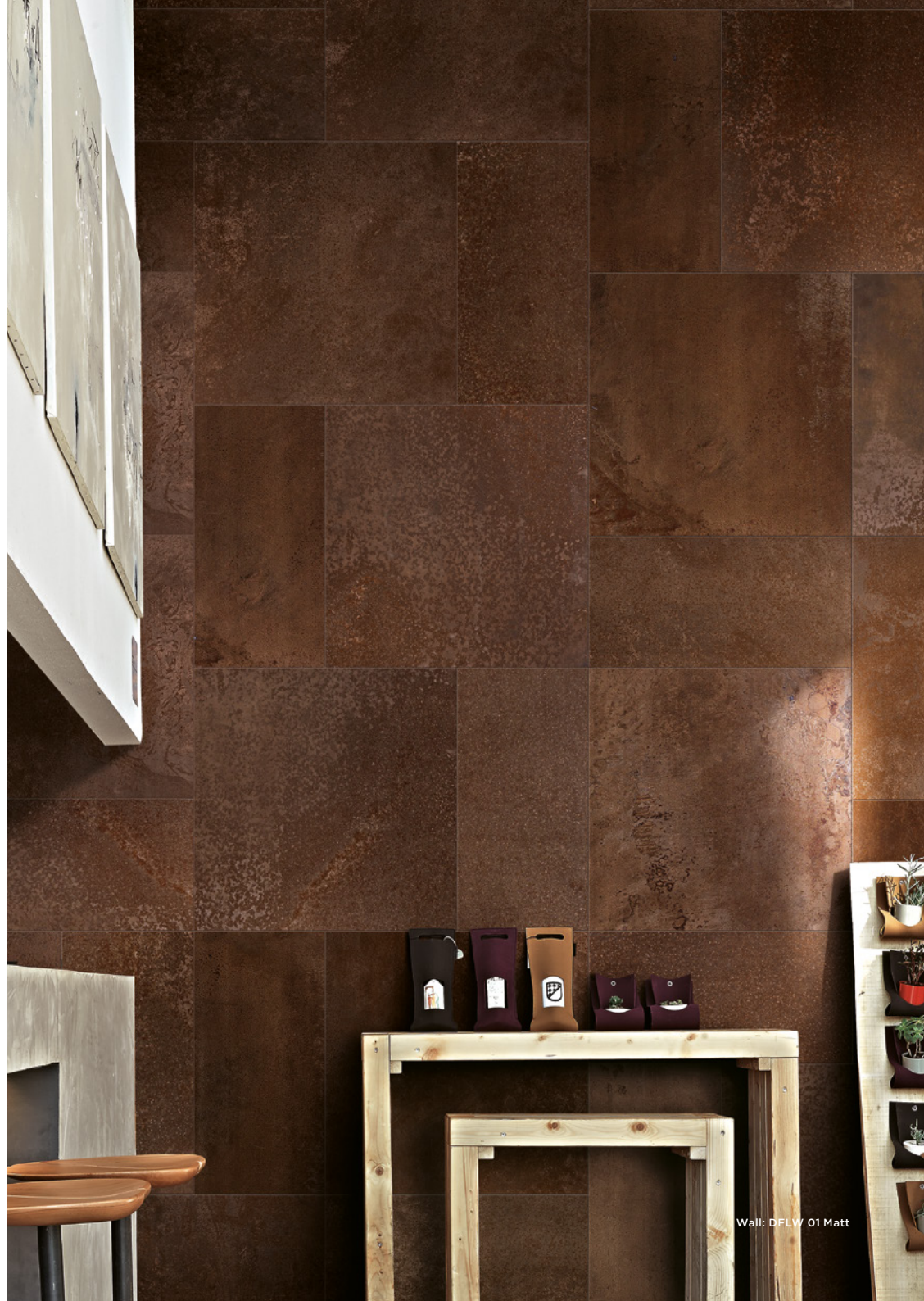
Wall: DFLW 01 Matt

Flowtech is a range of porcelain tiles with a bold urban and industrial aesthetic and contemporary metal-like design. Refer to Flowtech Magnum for 6mm-thick lightweight porcelain slab formats.