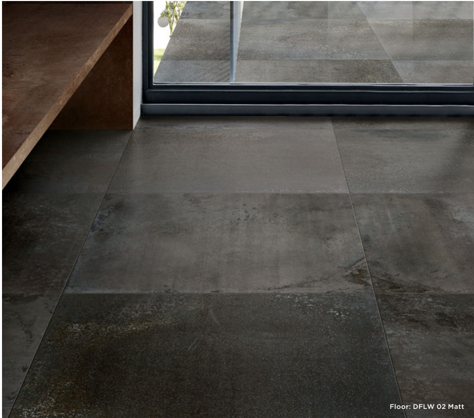
Floor: DFLW 02 Matt

3 Colours / 1 Finish / 5 Sizes / 1 Mosaic